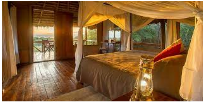
Karatu, Ngorongoro Farm House